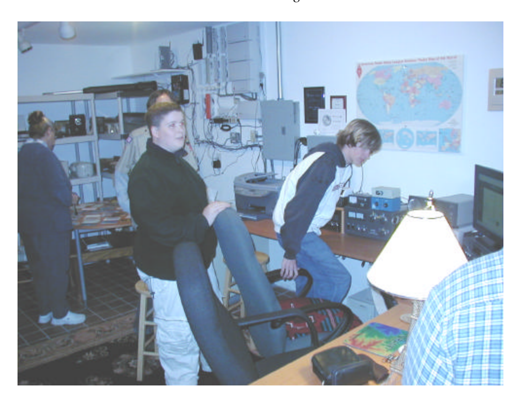
"I can do this..."