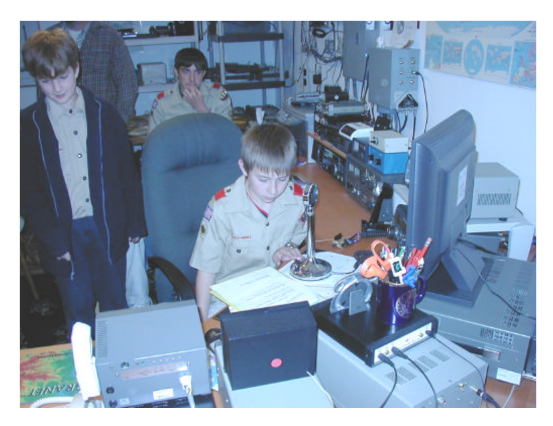
"You're five and nine. Good luck in the contest..."