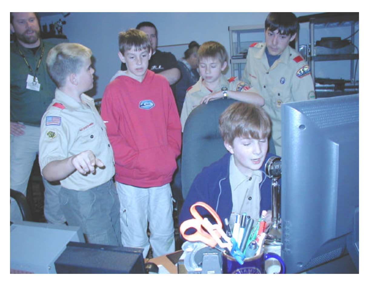
"Seventy-three Old Man..."